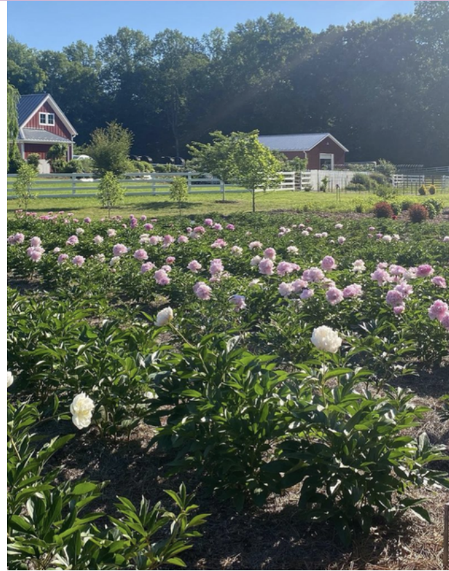
Toano Botanicals' incredible Peonies

We're planning to expand to the Fredericksburg and Charlottesville/Staunton areas. Do you know anyone in those areas that might be a good fit for hosting a pick-up outpost? We'd love to connect.